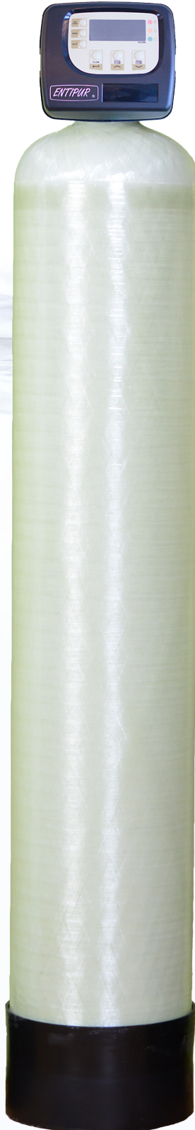
ENTIPUR® Monitor™ Valve