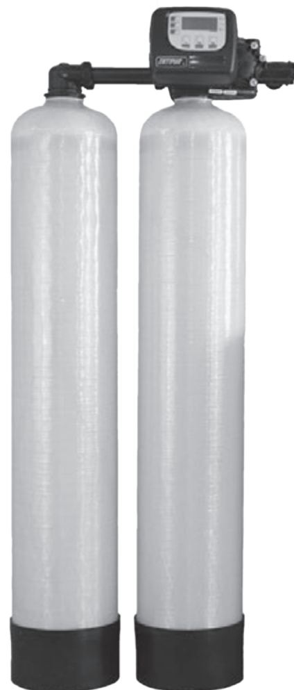
Brine tank included (not pictured)